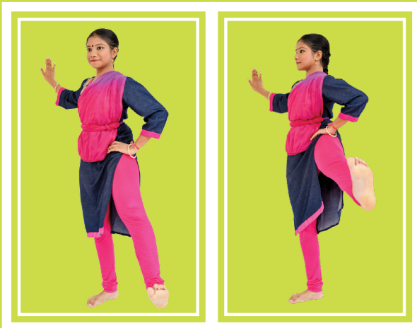
Lateral leg Swings

It is important for dancers to warm up before any dance activity to prepare the body for longer training. A warm-up should include exercises for ankles, knees, hips, shoulders, elbows and wrists.