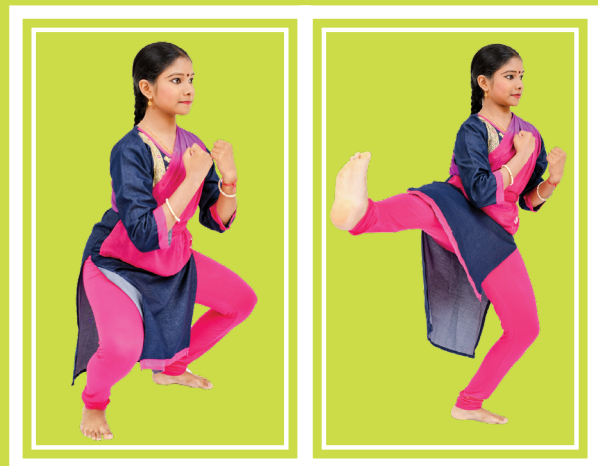
Squat side kick